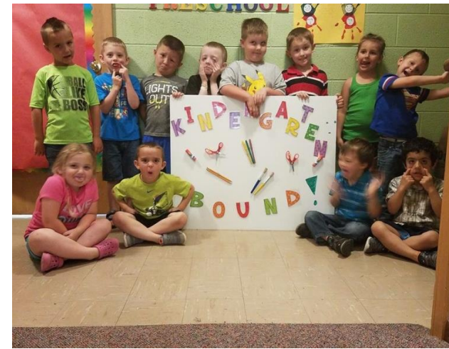
Noah's Ark Preschool Graduates headed to Kindergarten!