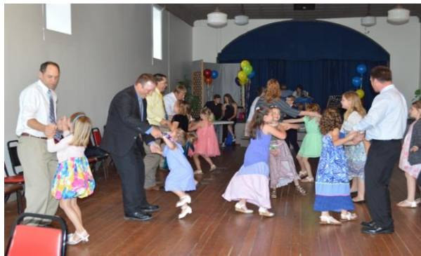
Page 9 THANKS TO THE ABELL FAMILY FOR ORGANIZING THE PICNIC, BOATING AND GAMES AT BENNINGTON STATE LAKE May 28, 2017